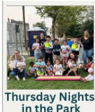
Thursday Nights in the Park