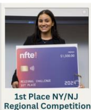
1st Place NY/NJ Regional Competition