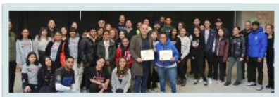
Shop with a Cop