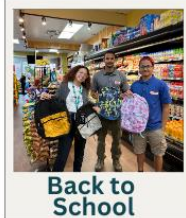
Back to School