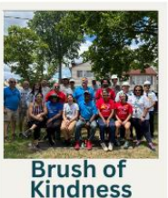
Brush of Kindness